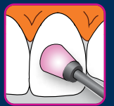
Step 2 Feather Light Pressure